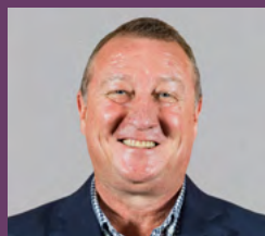
Cr Jeffrey Drayton Mayor Muswellbrook Shire Council