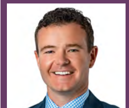
Cr Adam Shultz Mayor Lake Macquarie City Council