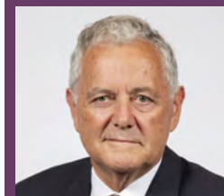
Cr Ross Kerridge Lord Mayor City of Newcastle