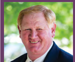
Cr Maurice Collison Mayor Upper Hunter Shire Council