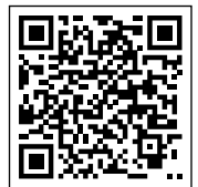
Watch the video

To stimulate the tourism industry, an opportunity exists to build a cycle trail from Hunter Valley to Newcastle and Lake Macquarie.