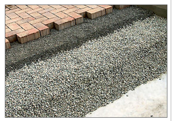
Figure 2: Easydriveways block paving.

A number of porous paving products are commercially available and the mechanism of infiltration can also vary – see following section for explanation.