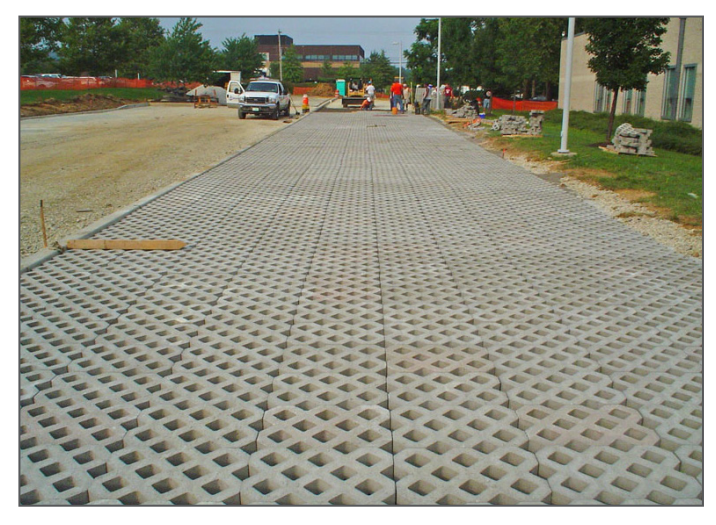
Figure 5: Propous paving grid system. (Source: CETCO contractor services).

Permeable pavements can be constructed using grids made of various materials such as concrete and plastics (See Figure 5). These paver units contain many evenly spaced void areas that are filled with sand, gravel or grass. Similar preparation is required to modular paving with the grid units laid on bedding layers.