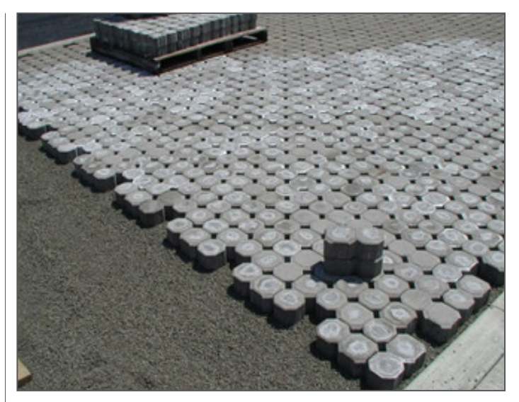
Figure 3: Porous pavers. (Source: Toulatin River Keepers).

Modular paving is generally made from concrete or clay and is available in various shapes and patterns. Modular pavers can be used on small jobs, such as footpaths, through to large hardstand areas like bus terminals.