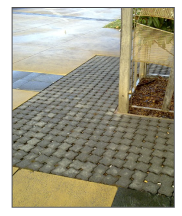
#4 FOOTPATHS Porous paving over the tree root

zone at Honeysuckle wharf, Newcastle