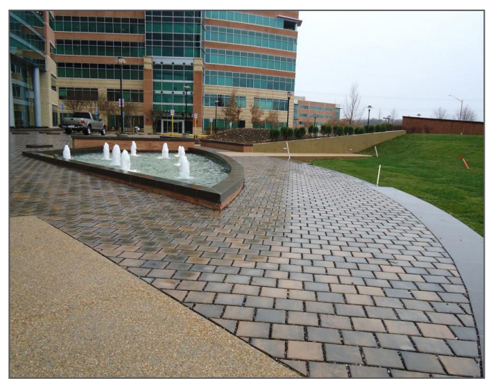
Figure 4: Monolithic porous pavers.

This type of pavement incorporates voids into the entire pavement structure i.e. the paver unit or road surface layer itself is porous. The most common materials used are porous concrete and porous asphalt which are specially manufactured by removing the finest components from the matrix.