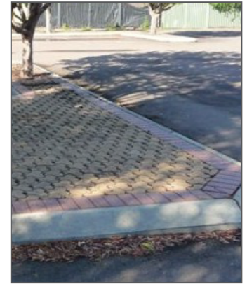
#3 CARPARK MEDIAN Porous paving used in a carpark median in Wyong Shire

Porous courtyard and footpath in residential setting in Sydney