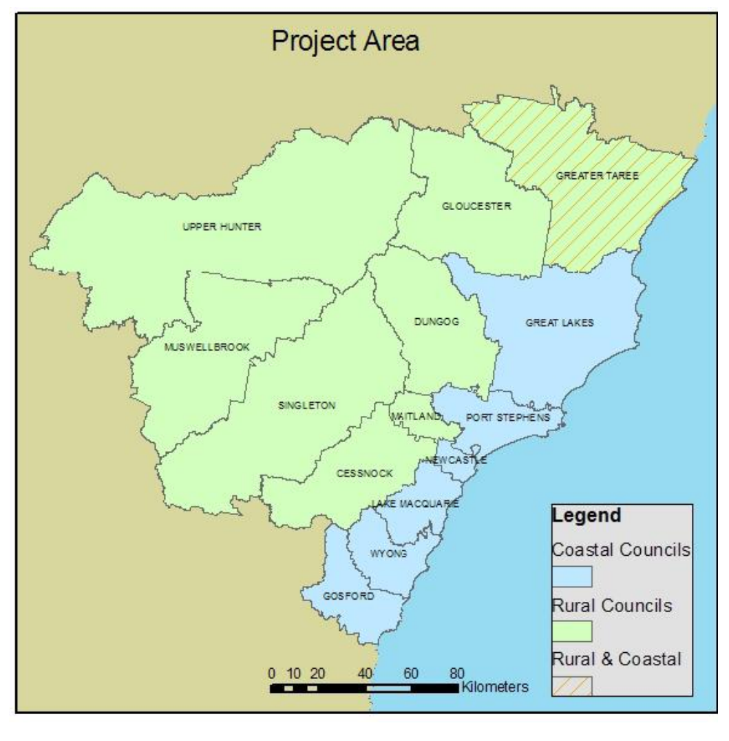
Figure 1: Project Area Indicating 'Coastal' and 'Rural' Councils

The selection of priority risks addressed in this report was based on a number of criteria, notably their initial risk rating and also the regional significance of the risks. The rationale for this focus is that, given resource constraints, Councils' climate change response efforts are best targeted in the short term at issues that matter most to it. Nevertheless, risks that are not addressed in the adaptation plan should not be ignored by Rural Councils or other agencies, a point discussed later in this report. Also underpinning this rationale is recognition that the capacity of each rural council will be enhanced through collaborative action. Particular benefits arising to councils include: